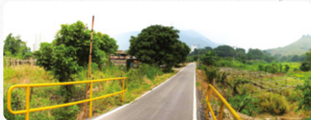
道路擴闊前 Before road widening

The Eastern Section (between Tsung Yuen Ha and Lin Ma Hang) of the Lin Ma Hang Road Widening Works is a Designated Project under the Environmental Impact Assessment Ordinance. A series of surveys and investigations were completed. Considering factors such as environmental impacts, land issues, traffic flow and other engineering elements, we have formulated the preliminary design scheme for the Project. We are now inviting public views to refine the design of the road and associated facilities.