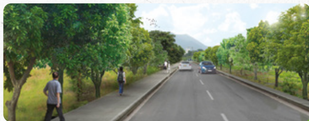
道路擴闊後（參考圖片） After road widening (for reference only)